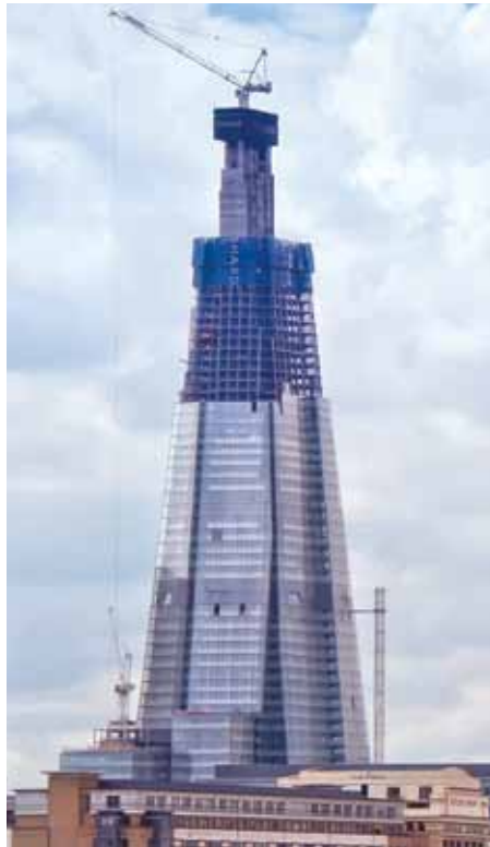
The Shard. Admixtures were utilised to deliver the quality of finish and speed of curing to support fast-track working without sacrificing other performance properties

compacting concretes (SCC) can only really be created using PCE-based admixtures. Such concretes can be placed with reduced manpower and have less potential for defects and cracking. They also allow speedier pours for more efficient construction time. All of these factors are of major importance to reduce cost and improve speed. If SCC is at the far end of the spectrum then S4 and S5 consistence concrete, using PCE-based admixtures, comes into its own as a clear, viable alternative to S2 with no negative cost implications.