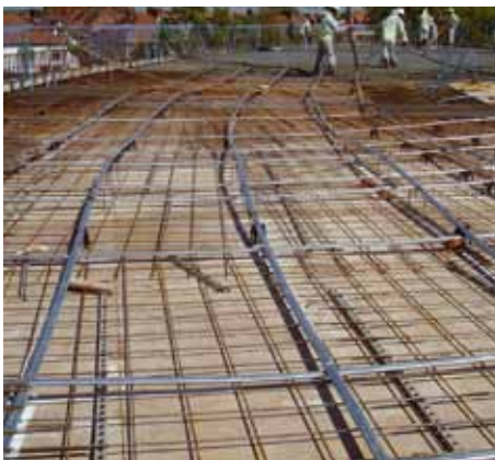
Bournville College, part of the redevelopment of the former MG Rover site at Longbridge

As well as affording greater flexibility of internal layout, post-tensioned slabs are able to follow irregular column grids and curves and cope with the complex geometry incorporated within many ambitious structures today.