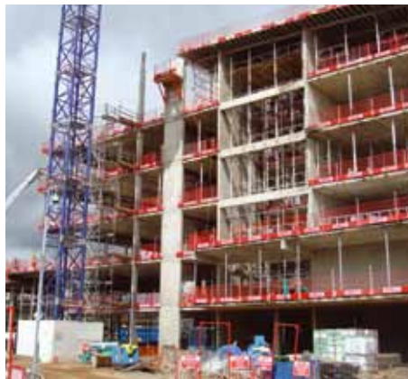
Post-tensioned concrete during construction, Whitmore School, Harrow

Post-tensioned concrete can span further than reinforced concrete and competes economically with steel structures. The longer spans that can be achieved by post-tensioning reduce the number of columns required and give greater layout flexibility and more expansive interiors.